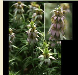
Lemon Bee Balm - (Monarda citriodora)